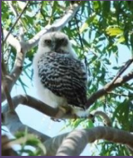
Powerful Owl baby

Eastwood – Epping – Marsfield – North Epping – Lane Cove National Park