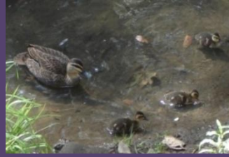
Pacific Black Duck family