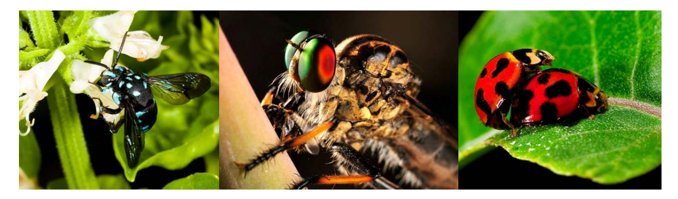
And it is has inspired me to create artwork as well...